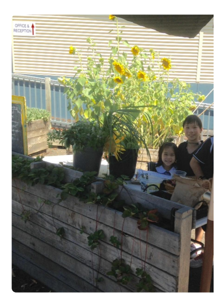
Garden club, for students from Year 3 up, meets on Tuesday at Iunchtime. We have had a bumper crop of eggplants and

chillies as well as many other vegetables planted in our vegie garden boxes and are enjoying the beauty of the huge sunflowers we planted last year.