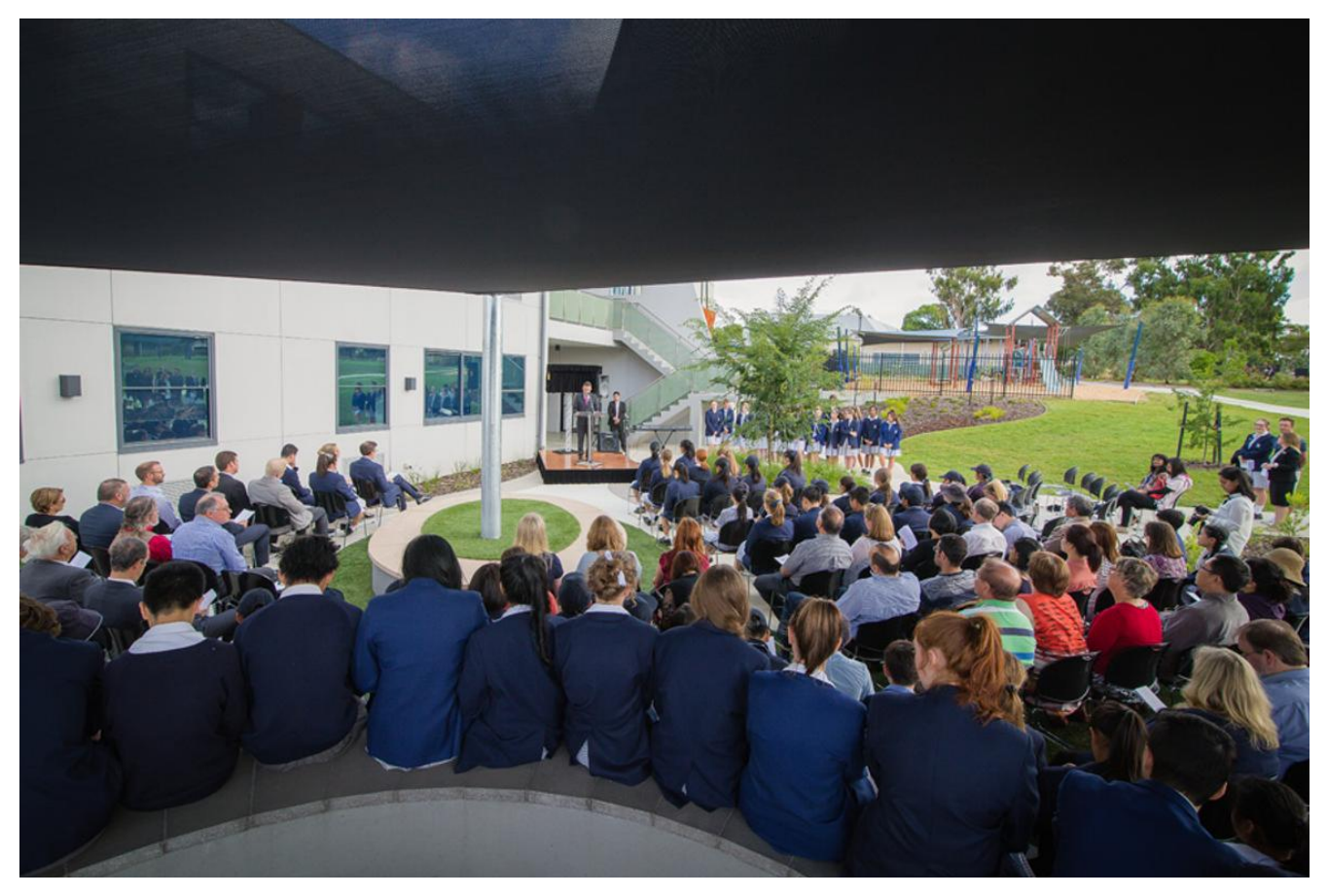
Read online: https://newsletters.naavi.com/i/O5gpYyN