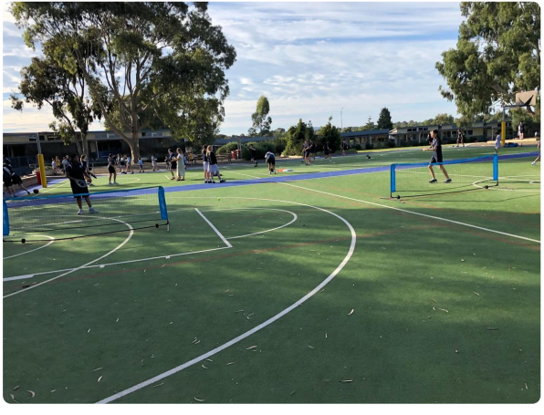
We had 30 boys training on Tuesday and over 40 girls on Thursday morning from Years 7-10. It is so great to have sport back!