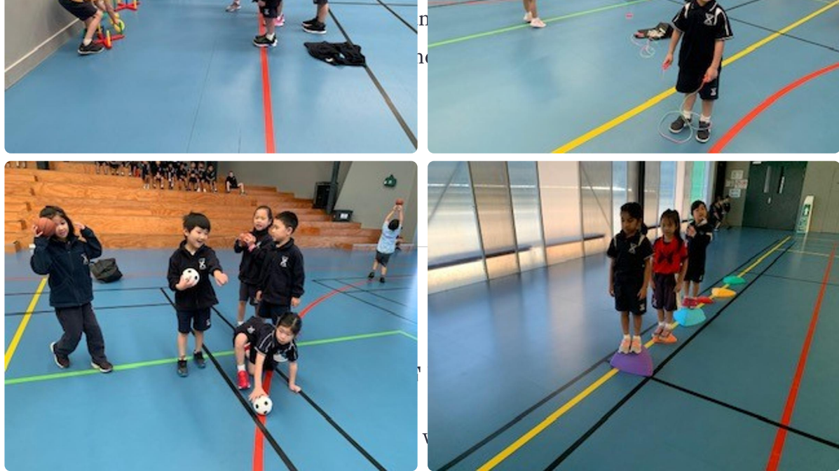
organising dooks and stationery, learning classroom routines and learning about our new classmates and teachers. We also have had a blast in our first lessons together.