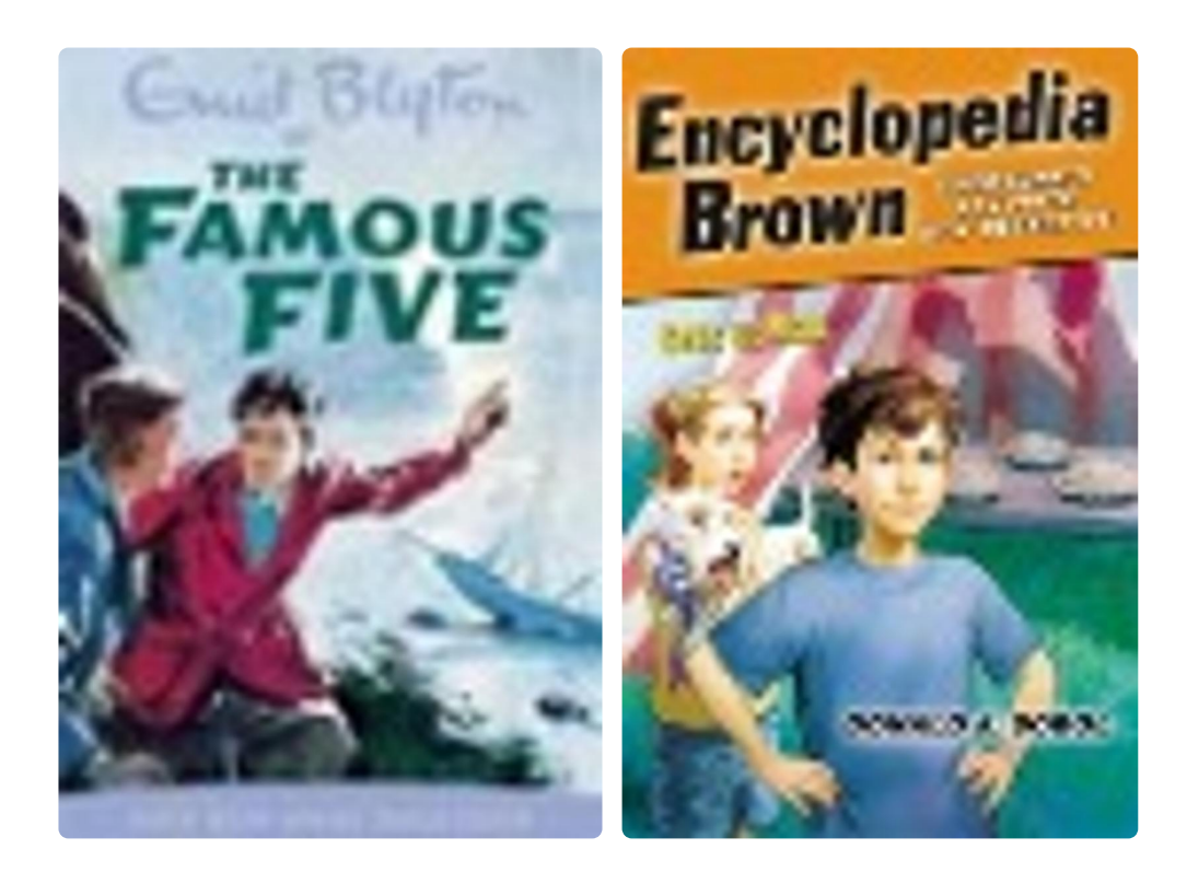
ARs in the Senior Library