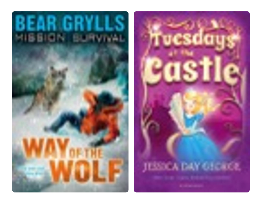
There will be more information about ARs in future newsletters.