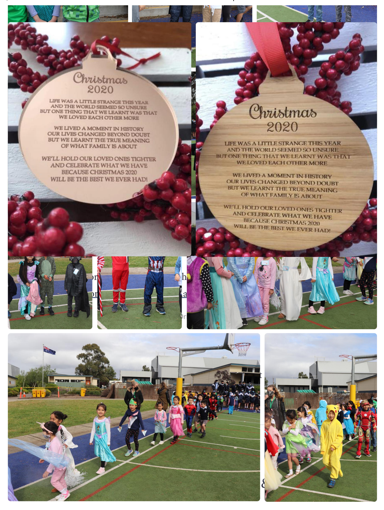
We are so glad to have you back at school!

To share our joy and happiness at their return to on campus learning, there were some grand decorations to welcome our Year 8 and 9s on 26 October.