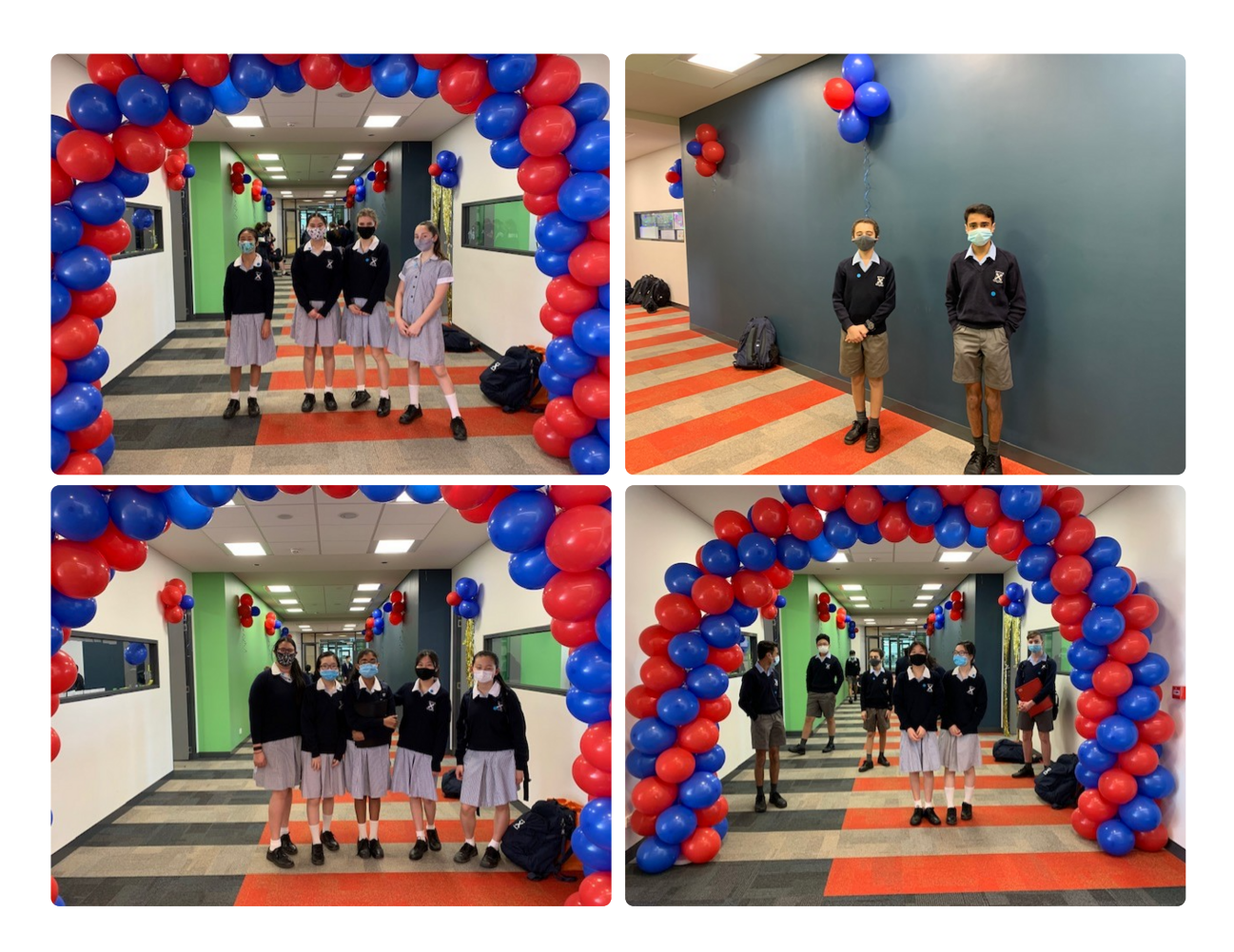
On Friday 30th October, we had a pizza lunch party followed by 2 periods of fun games and competition.