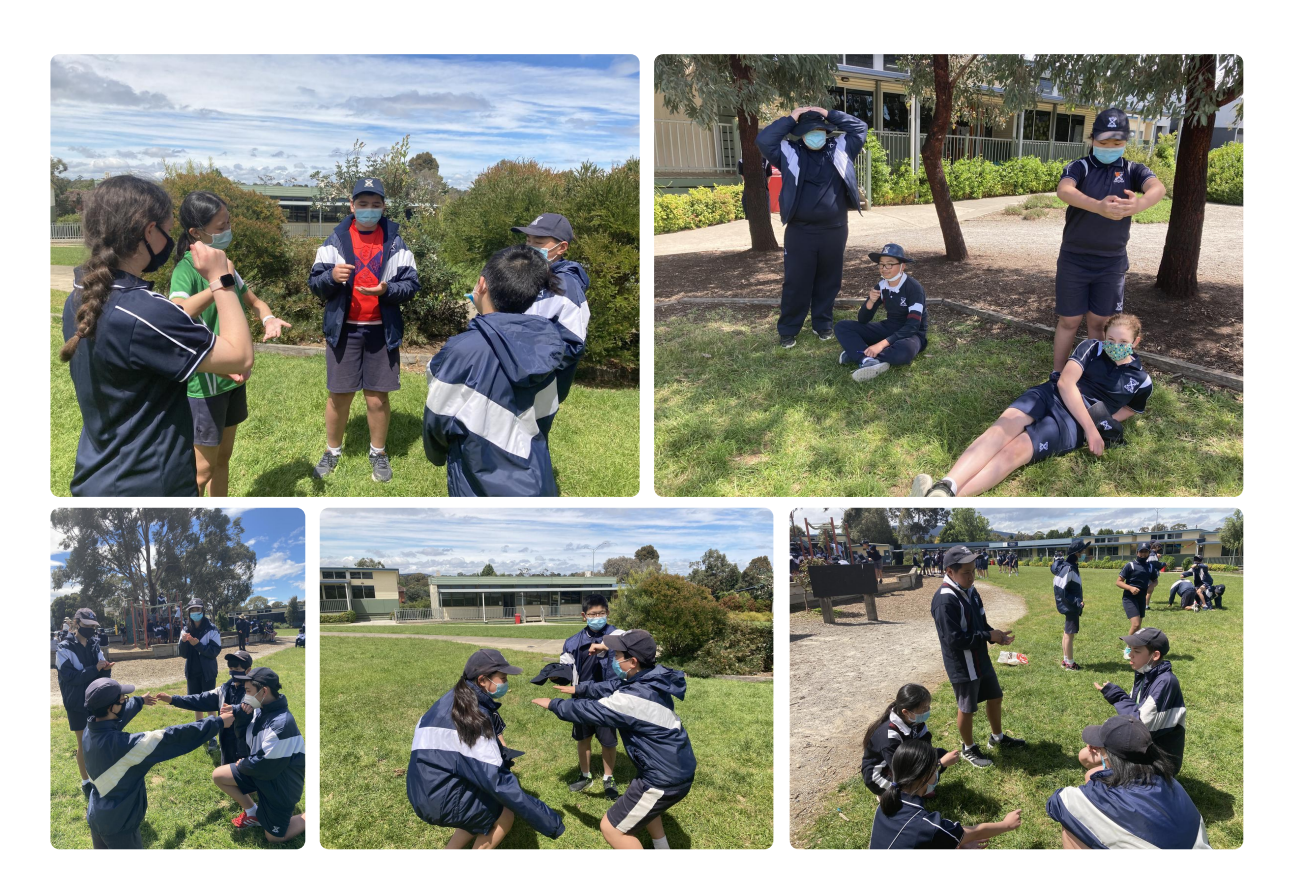
What are these Year 7s doing? Well! These students are collaborating, communicating, listening, laughing and having an absolute ball with our fantastic Year 7 leaders.