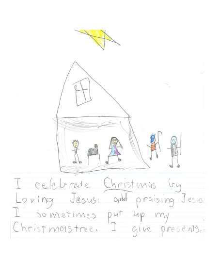
Junior School Christmas Musical