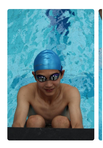
Congratulations to Deakin for taking out the title for the

Highlights of the day included the first ever VCE inflatable boat relay and Teachers vs. Students Big Bomb Competition.