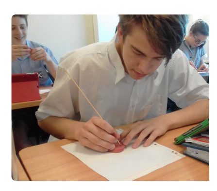
Students had a turn at copying the wedge shaped symbols onto clay to create their own

Year 11 students in Unit 1 have been learning about the development of writing by the Sumerians, during their Ancient Mesopotamian Class.