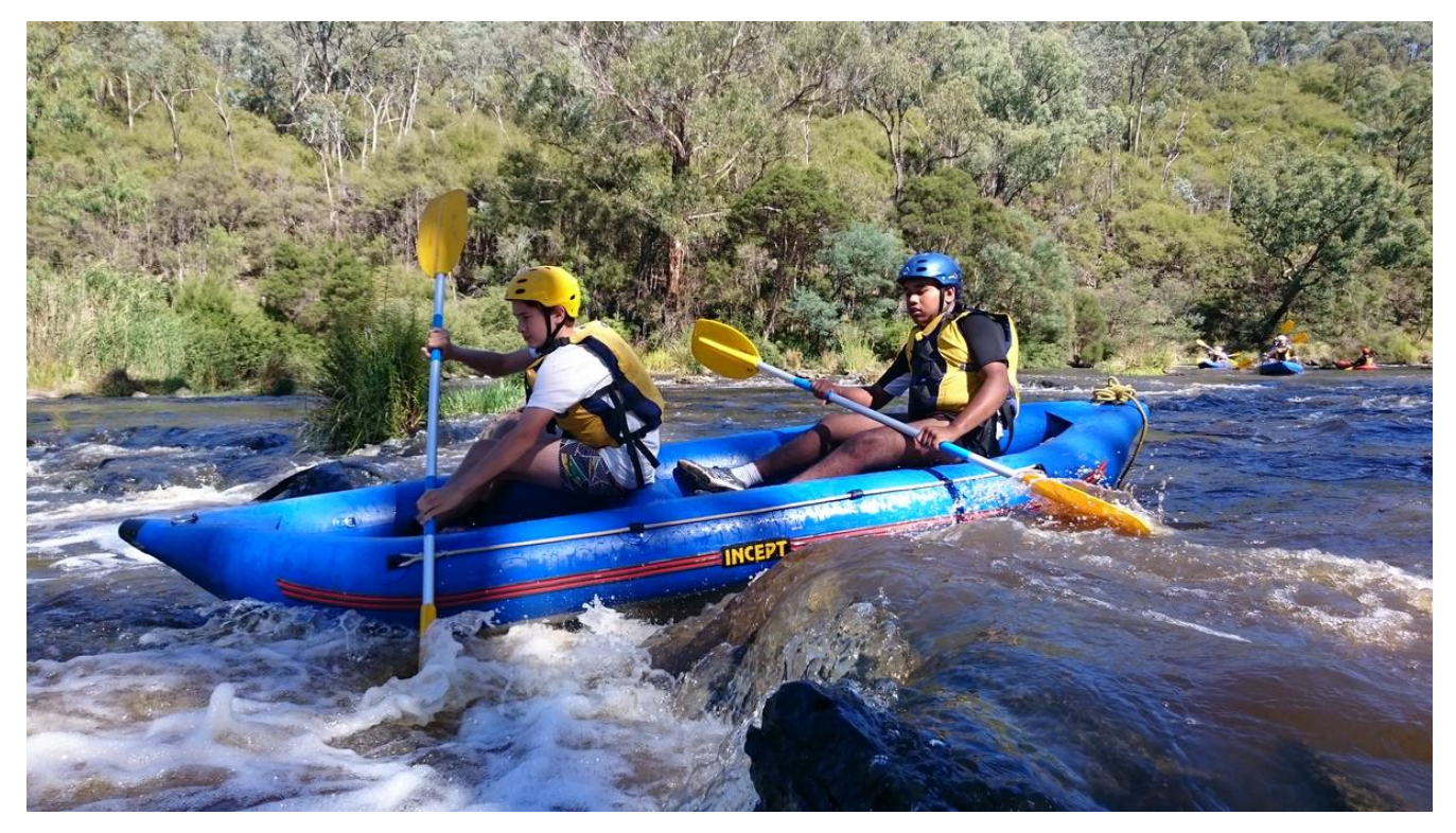
Read online: https://newsletters.naavi.com/i/OMObxnJ