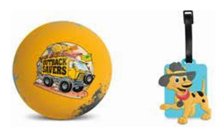
Mud Splat Handball Outback Pat Bag Tag

Exciting new Term 2 rewards with an Outback Savers theme are now available, while stocks last!