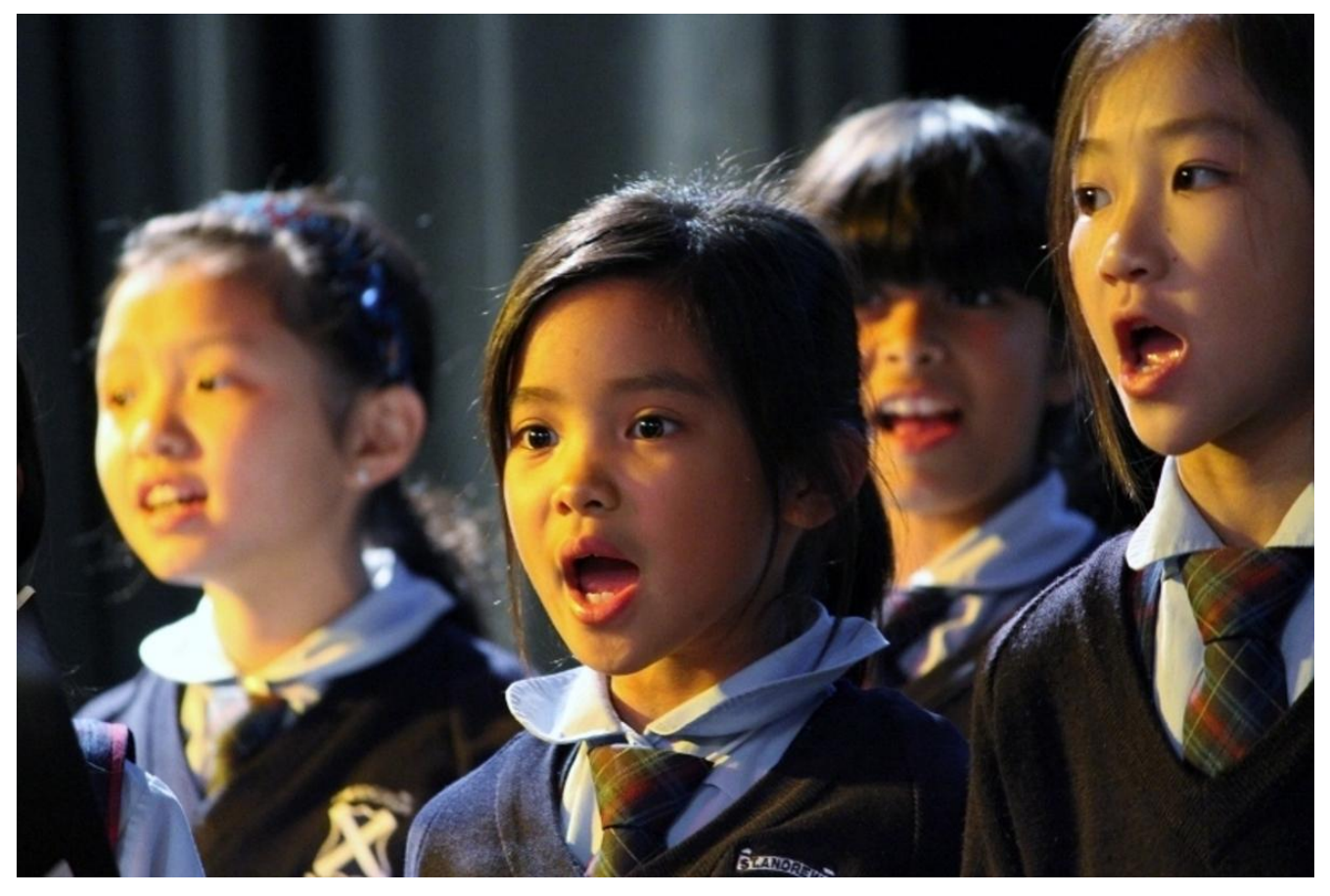
Read online: https://newsletters.naavi.com/i/kNV9Xa5